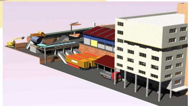
ROSE future headquarter, recycling unit and plastic & paper factory