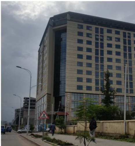
We are located on SNAP PLAZA mall, 3rd floor Africa Venue, next to Millennium Hall

safety shoes, rain coat and plastic boots. In addition, workers have workmen insurance and 50% medical coverage while on duty.